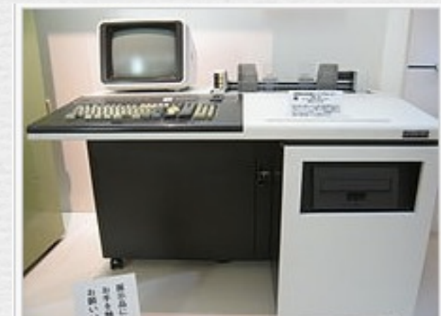
Toshiba JW-10, the first word processor for the Japanese language (1971-1978 IEEE milestones)